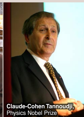
Claude-Cohen Tannoudji, Physics Nobel Prize