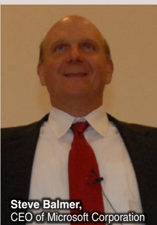
Steve Balmer, CEO of Microsoft Corporation

The international conference European Science and Technology Forum is held by Česká hlava (Czech Mind) in cooperation with the University of Economics in Prague. The objective is to make it possible for the people who influence the future of the entire society to meet. Leading scientists, industrialists, politicians and representatives of academia regularly meet in Prague. The ambition of the project is to create functional and efficient bridges between these elites which often exist too separately and communicate little among them and to offer space for the exchange of ideas and experience indirectly promoting better communication and cohesion of scientific and other research stations with the commercial sector.