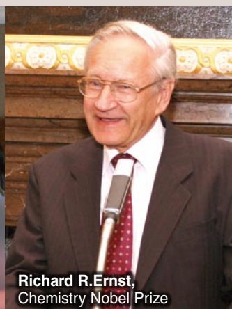
Richard R. Ernst, Chemistry Nobel Prize