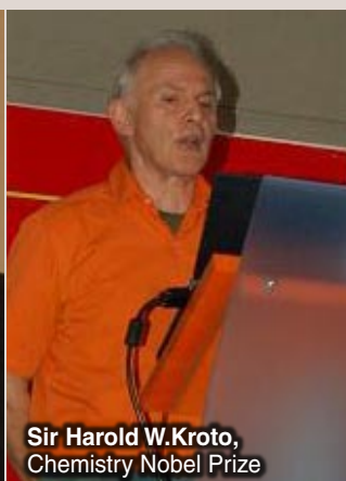
Sir Harold W. Kroto, Chemistry Nobel Prize