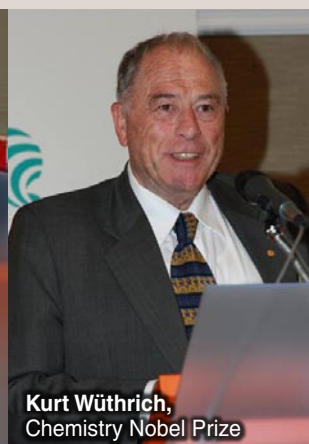
Kurt Wüthrich, Chemistry Nobel Prize